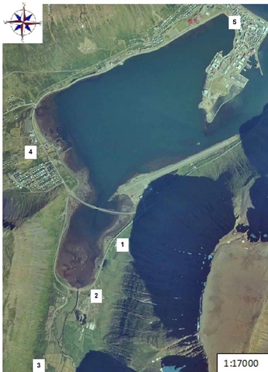
Figure 2 Aerial photograph of Skutulsfjörður. The numbers give the location of the (1) waste incinerator, (2) nearby sheep farm in Engidalur, (3) nearby dairy farm in Engidalur; and (4,5) local town of Ísafjörður.

As the dairy herd was localized at the farm and fed on hay from the valley, one additional composite milk sample and